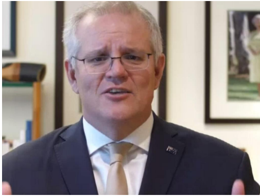
📷 Scott Morrison in the video message.

“Our deal with Australians is that when vaccination rates hit 70 and 80 per cent, we do begin to open up. Australians can leave and return and Australians who are overseas and are vaccinated can come home,” he said.